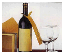
LANDOLIUM Hulshout 0032(0)15/222911