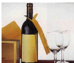
LANDOLIUM Hulshout 0032(0)15/222911