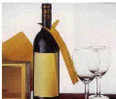
LANDOLIUM Hulshout 0032(0)15/222911