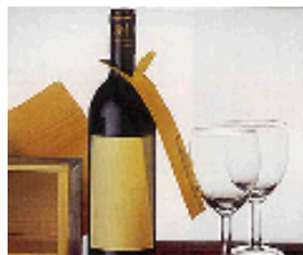
LANDOLIUM Hulshout 0032(0)15/222911