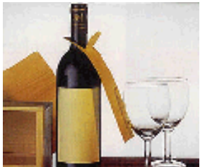
LANDOLIUM Hulshout 0032(0)15/222911