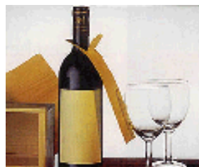
LANDOLIUM Hulshout 0032(0)15/222911